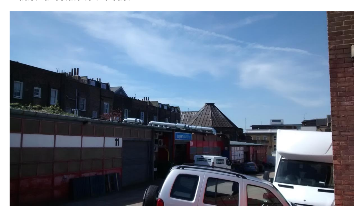
Image 2: Photograph of the Silencers from the inside of the Roman Way Industrial Estate