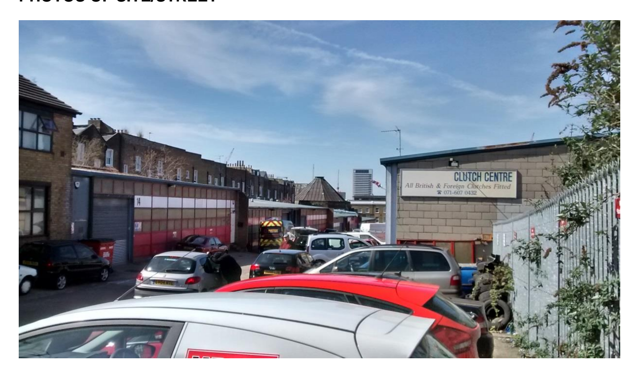
IMAGE 1: Photograph of the site from the entrance to the roman way industrial estate to the east